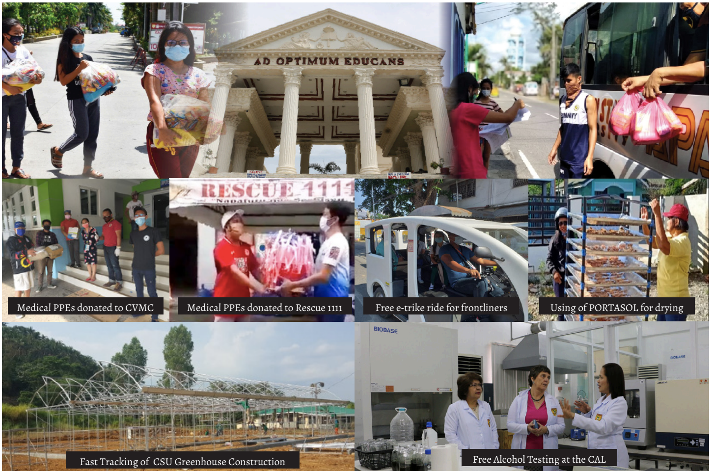
Medical PPEs donated to CVMC

The CSU Community also shared in-kind and provided assistance to the frontliners and to the less fortunate members of the community by donating food items to frontliners manning checkpoints in the municipality of Gonzaga and Sta Ana. Fisherfolks in Gonzaga were also assisted by buying their catch and dried them through PORTASOLS. CSU also assisted the barangay officials in the distribution of food packs from the municipal government of Lal-lo.